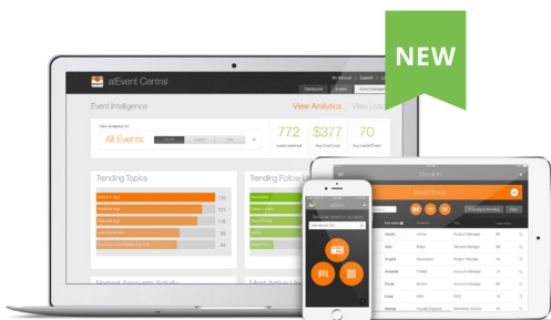
Program runs in iOS & Android Smartphones and Tablets